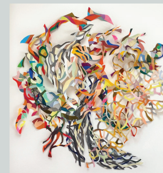
Holly Wong Arachne 1, 2020 colored pencil, graphite on woven drafting film