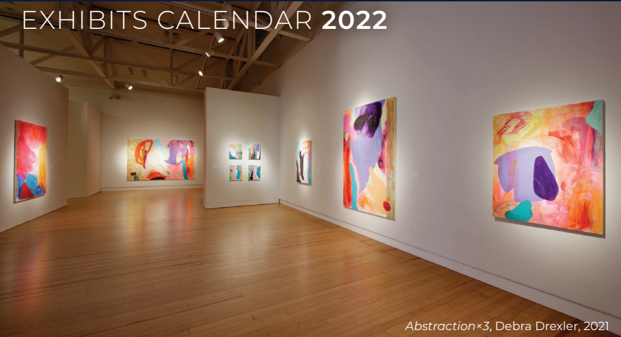
Abstractionx3, Debra Drexler, 2021