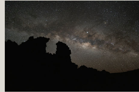
Stan Honda Lava, Haleakalā , 2019 photography

The night sky landscapes of New York-based photojournalist Stan Honda show the beauty of the sky in relation to the Earth as it moves through the universe with a multitude of celestial objects. He has worked as an artist-in-residence at six national parks, including Haleakalā National Park on Maui. This exhibition will highlight his recent work of Haleakalā and other works from the night skies project.