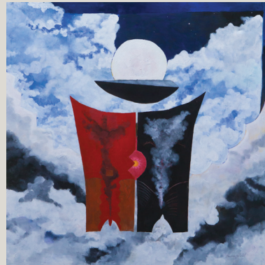
Imaikalani Kalahele Papa Iā'ua 'o Wakea , 2017 acrylic on canvas