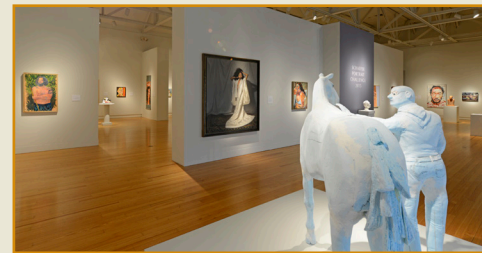
Schaefer Portrait Challenge 2015

January 16 - March 18 Opening Reception January 14 Schaefer Portrait Challenge