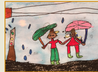
Student work, Young Creatives 2016

Our semi-annual student show features the work of Maui students K-12, from both private and public schools. Under the direction of their classroom teachers, students are asked to explore this year's "outer space" theme with imagination and brainstorming. High school students are invited to become part of a collaborative lab team working with artisan mentors to create an immersive intergalactic space station for the public to explore through S.T.E.A.M. educational learning in science, technology, engineering, art, and math.