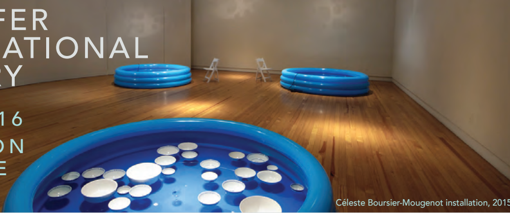
Céleste Boursier-Mougenot installation, 2015

August 2 - October 3 Opening Reception August 1