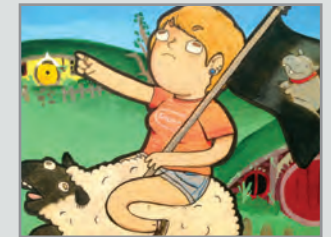
Student work Young Creatives 2014

This exhibit takes place every other year and features the work of Maui students from kindergarten to high school in both private and public schools. Under the direction of their classroom teachers, students are asked to explore this year's given theme of "neighborhood" to observe, identify, and create artwork that reflects their unique ideas and sense of place. The playful gallery design will lead viewers on a topographical tour of our island communities through the eyes of our students.