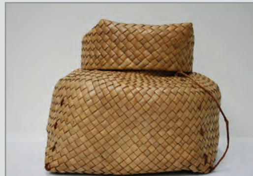
Piko Style Basket, lau hala Bishop Museum Collection

An accompanying invitational exhibition, Hō Mai Ka Hala: Bring Forth The Hala will present the work of contemporary lau hala weavers in Hawai'i. These artisans fall within the hierarchy of kumu (master teacher) and haumana (apprentice) levels of accomplishment as weavers of lau hala . Their work will represent the individual techniques, style, and designs of each island.