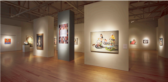
Schaefer Portrait Challenge 2018

This triennial statewide juried competition makes its much-anticipated return. The Challenge has been a signature exhibit of the Gallery since 2003, inviting Hawai'i's artists to take portraiture to new heights by exploring expressive and emotional depth in capturing the essence of their subjects. Their interpretations will offer a range of approaches, thoughts, and techniques that tell the personal stories of our island communities. Two substantial cash awards will recognize outstanding accomplishments – the Jurors' Choice Award and The Gene & Ruth Freedman People's Choice Award.