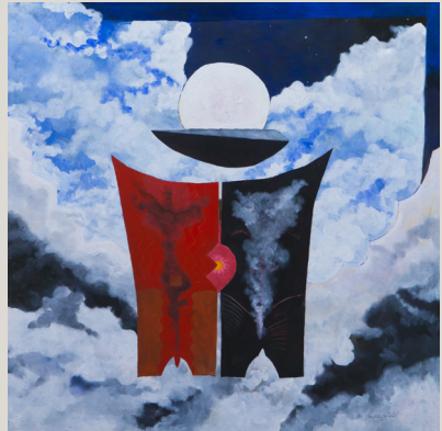
Imaikalani Kalahahele Papa Iā'ua 'o Wakea , 2017 acrylic on canvas