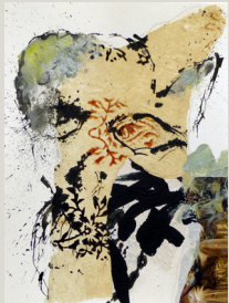
Don Bernshouse, Head with India Printed Paper and Korean Calligraphy , 2018 mixed media on paper