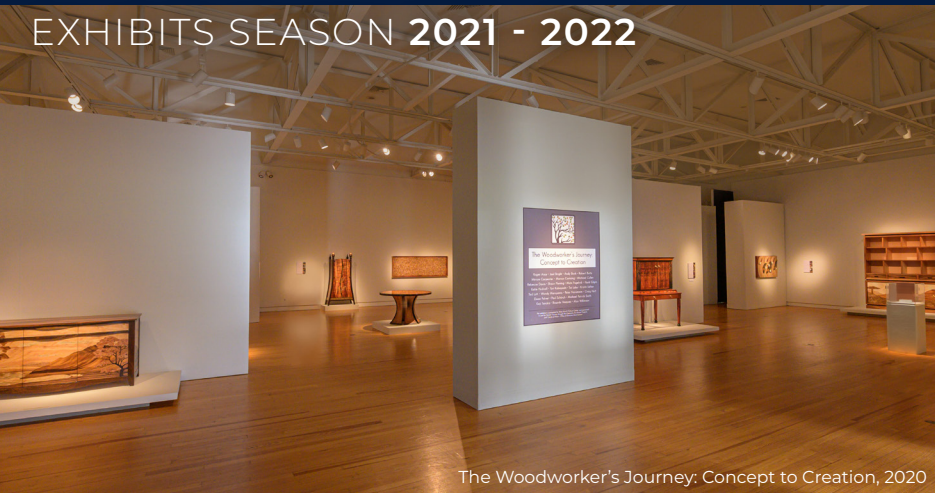
The Woodworker's Journey: Concept to Creation, 2020